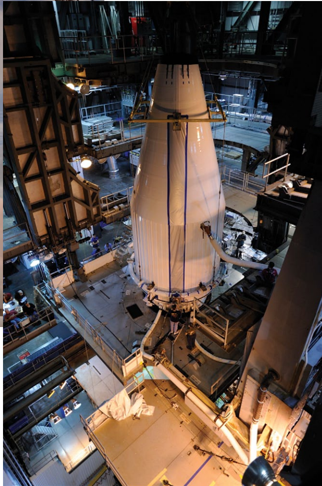
The National Reconnaissance Office's NROL-38 payload, encapsulated in a 4-meter-diameter payload fairing, is mated to an Atlas V booster in preparation for launch from Space Launch Complex-41.